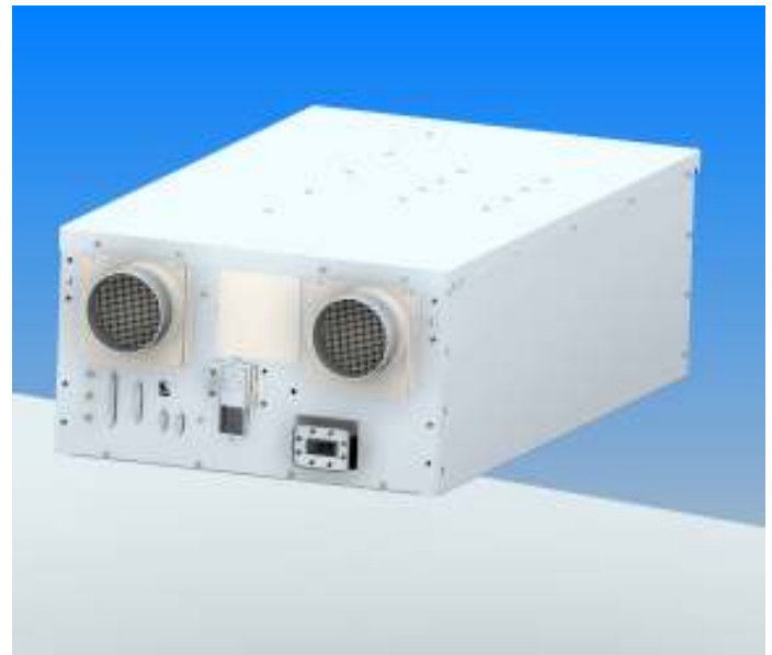
MC1300 configured with 200W SSPA